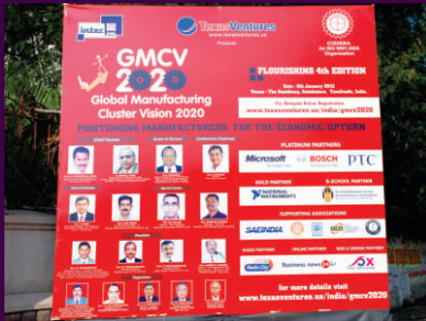
Hoarding @ the entrance of the Conference Venue