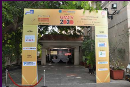
Arch at the Entrance of the Conference Venue