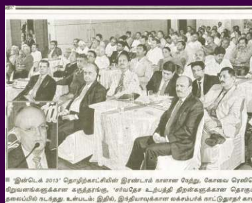
Event Coverage in News Papers