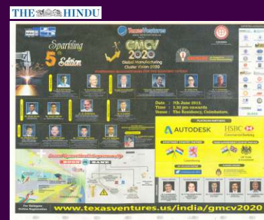
Half page Advertisement in The Hindu