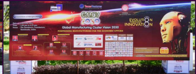
Hoarding @ the entrance of the Exhibition Venue